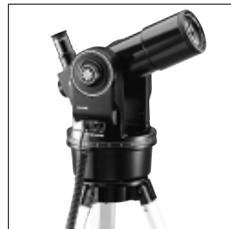
Fig. 3: ETX-60AT Telescope in Altazimuth configuration.

The #882 Standard Field Tripod provides for an Altazimuth alignment (Altitude/Azimuth, or vertical-horizontal with Autostar) configuration for the ETX-60AT or ETX-70AT Astro Telescope models.