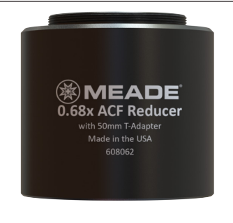
Fig. 2: 50mm T-thread Adapter